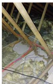
1. Trussed rafters