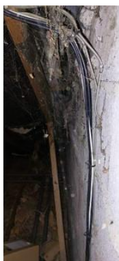
3. Junction between single storey roof and two-storey building