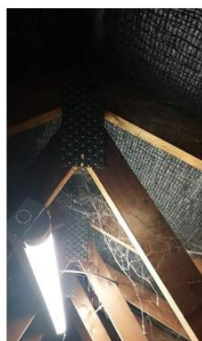
4. Roof ridge