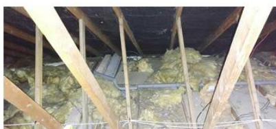
2. Trusses out of plumb