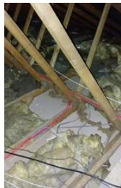
1. Trussed rafters