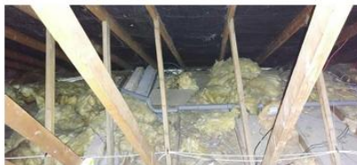
2. Trusses out of plumb