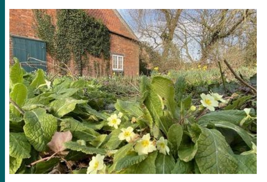
Spring blooms at Cogglesford Mill

As we march into Spring, it is lovely to have more daylight. Why not use some of those extra hours to explore our network of <u>Stepping Out</u> walks?