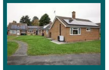
We're delighted to have secured a grant of £9.1m, which adds to £9.3m already allocated in our budgets for decarbonisation and

marking the 80th anniversary of VJ Day at the National Memorial Arboretum. This will all be accompanied by a national engagement programme, including educational resources and creative community activity.